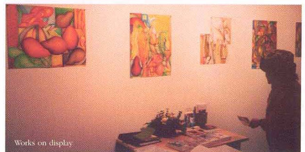
Works on display